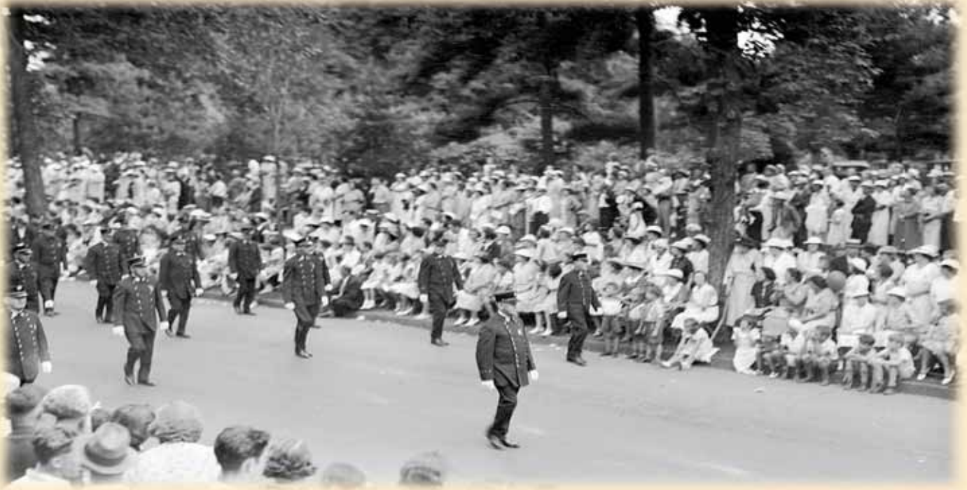
05-04808_715. Members of Albany's Police Department marched proudly in the Dongan Charter Day Parade. Broadcasts and newsreels of the civic and military parades allowed people across the nation to join Albany in celebrating.