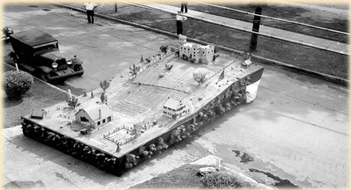
05-04808_724. The Bureau of Streets Department constructed this float to represent State Street in 1614, when the original site of Albany consisted of farms and a fort.