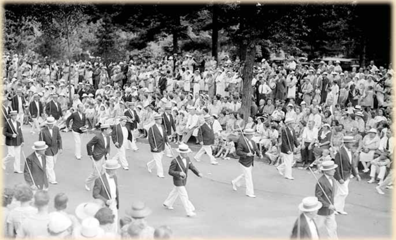
05-04808_706. All of Albany came out to join in the four days of parades and celebrations that marked Albany's 250 th anniversary as a chartered city.

The photos below show the parade of people and floats that commemorated this occasion: