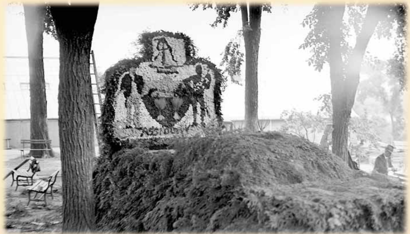
05-04808_705. Float depicting the Albany City seal under the city's original seal. Across the bottom is Albany's motto, Assiduity, "continuous personal attention to a task."