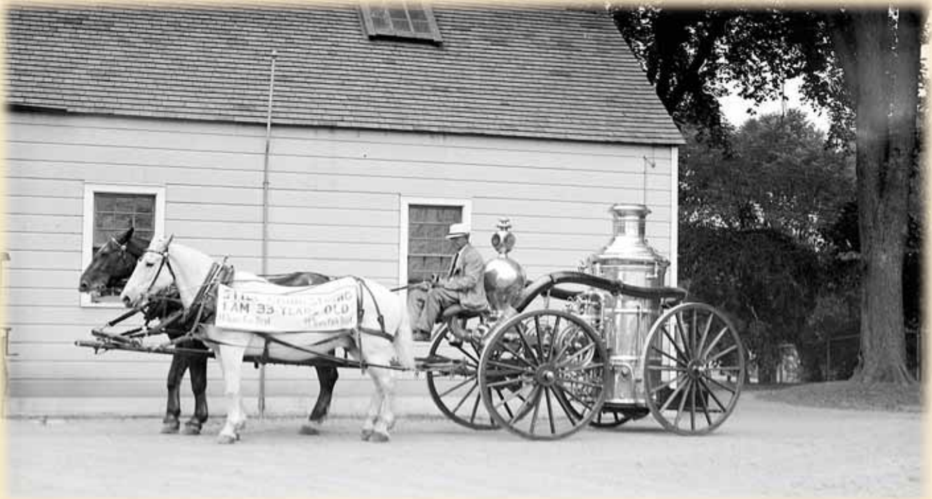
05-04808_717. Fire Horses pulled wagons before fire trucks were used. Along with the old fashioned apparatus, these fire horses wait for a spot in the Dongan Charter Day parade of 1936.