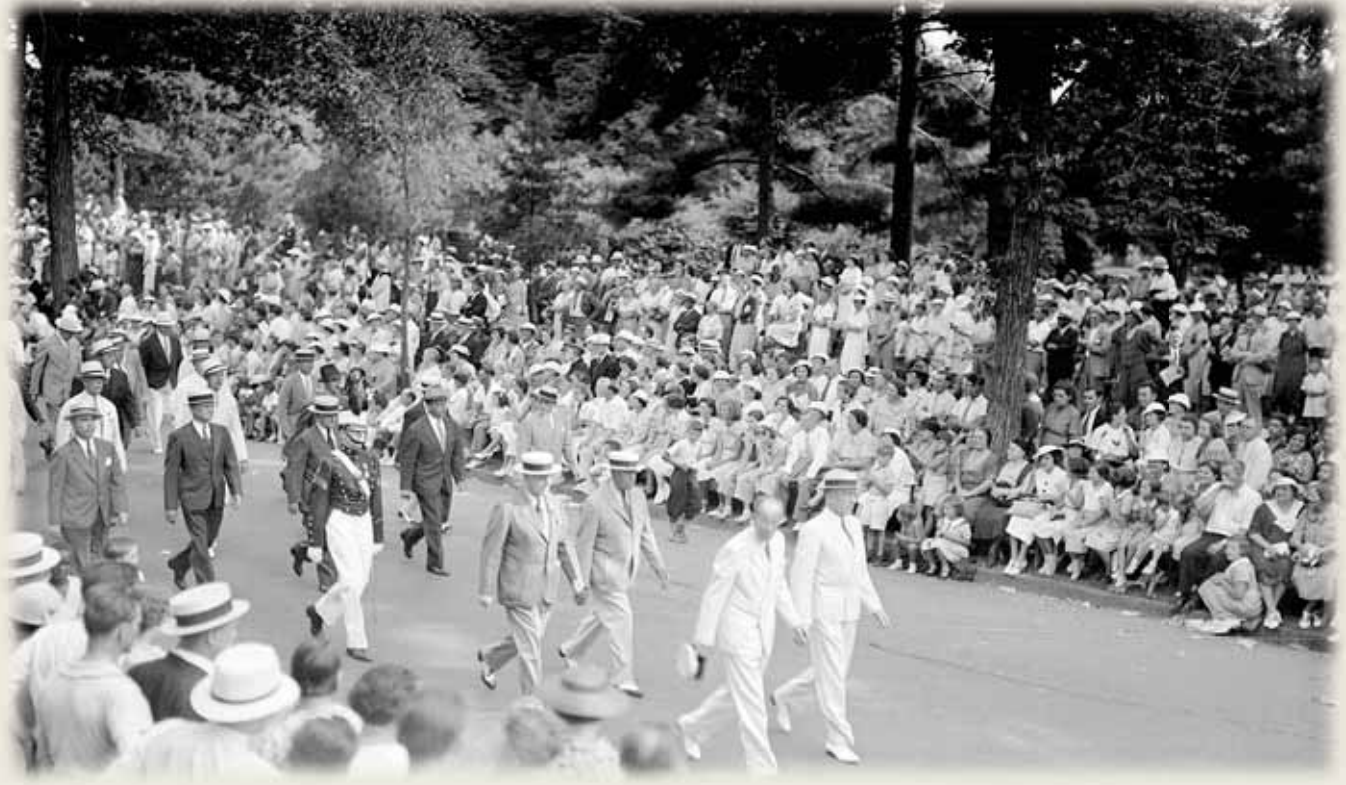
05-04808_704. Mayor John Boyd Thatcher (front, left) led the parade in celebration of Albany's 250 th anniversary as a chartered city.