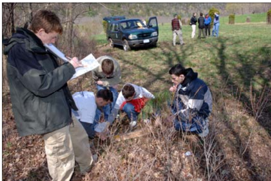
Learn to identify trees