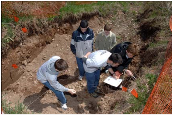
Investigate the impacts we have on our soils