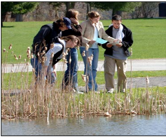
Discover what lives in aquatic environments